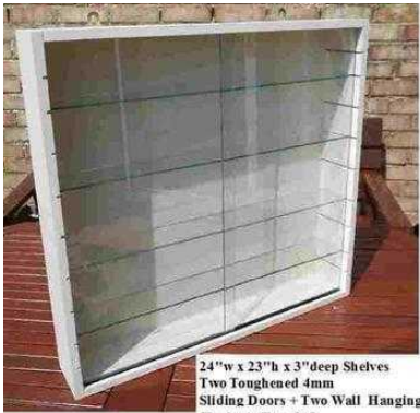
24" w x 23" h x 3" deep Shelves Two Toughened 4mm Sliding Doors + Two Wall Hanging Hooks At Top £45