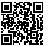
Table. Circular Mariners Table https://www.freeadsz.co.uk/x-461184-z

Solid wood . "Mariners Table" ex John Lewis original cost £400. 100cm. (3ft) Diameter. Excellent robust table in very good condition. ;