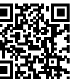
Table. Circular Mariners Table https://www.freeadsz.co.uk/x-461184-z