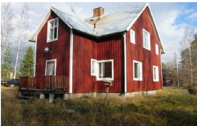
200mq #house 2 #kitchens 1 huge #livingroom 1 #bathroom 2 #bedrooms 4 spacious #rooms and #closets under the roof 1 #basement with 2 boilers and possibility of a second bathroom upstairs 5100mq #garden with #garage and #shed House in a small #village in #Sweden with #lakes and #forest all around and #free #sauna :) #property #realestate #hus #villa #fritidhus #casavacanza #casavacanza #holidayhouse #writersden #immobili #fastighet