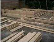
CUT TO MEASURE COMPONENTS