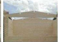
PRE-BUILT ROOF APEX