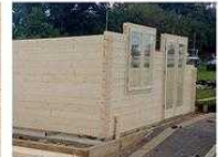
SUPPLIED WITH WINDOWS & DOORS