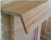
19mm TONGUE&GROOVE ROOF BOARDS