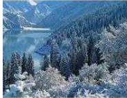
SLOW GROWN SPRUCE FROM SWEDEN