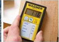
KILN DRIED TIMBER