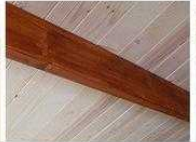
MASSIVE / GLULAM ROOF BEAMS