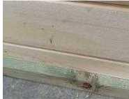
PRESSURE TREATED BEARERS