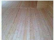
OPTION FOR 19 or 28 mm T&G FLOOR BOARDS