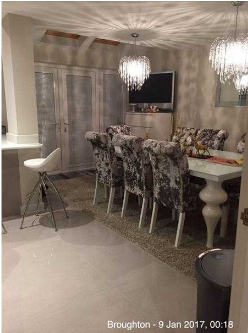
Broughton - 9 Jan 2017, 00:18

Location South East, Buckinghamshire https://www.freeadsz.co.uk/x-499107-z